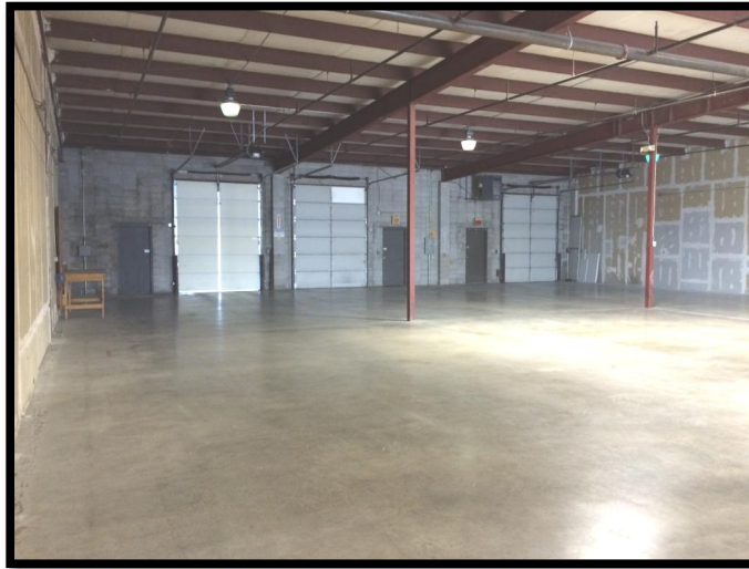
3045 C-D Warehouse (North View)