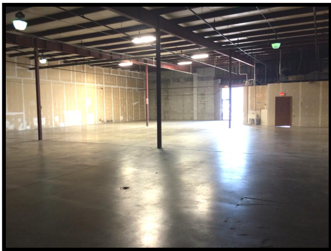
3045 C-D Warehouse (South View)